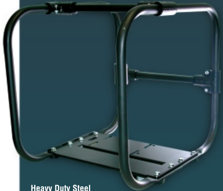
Heavy Duty Steel Roll Cage Assembly