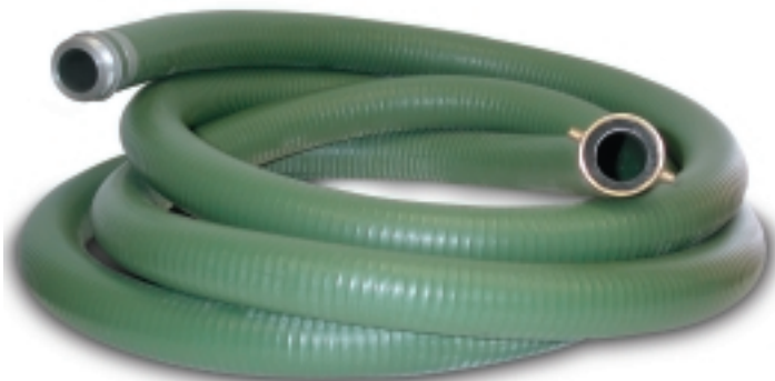
PVC Reinforced Suction Hose