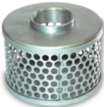
Standard Suction Strainer w/ Small Openings